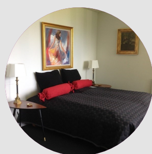
HOTEL JUELSMINDE STRAND TOURIST CLASS JUELSMINDE, DENMARK 70 ROOMS