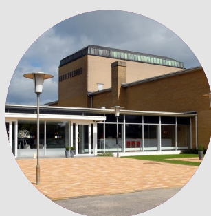
HOTEL NORHERREDHUS 3* NORDBORG, DENMARK 29 ROOMS