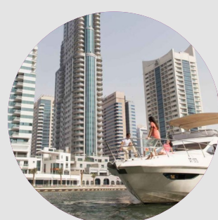
LA VERDA DUBAI MARINA 4* DUBAI, UAE 150 ROOMS