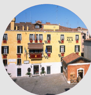
HOTEL ALA SUPERIOR 3* VENICE, ITALY 82 ROOMS