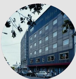
HOTEL HAFNIA 4* TORSHAVN, FAROE ISLANDS 57 ROOMS