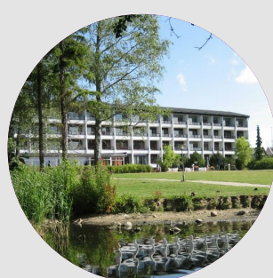
HOTEL SOEPARK MARIBO 3* MARIBO, DENMARK 109 ROOMS

We welcome these new properties to the Supranational Hotels Portfolio this month. For more information please visit our website .