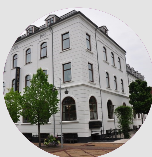
HOTEL PHOENIX 3* BRONDERSLEV, DENMARK 3 ROOMS